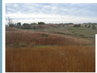
Formerly grazed, prairie persist on steep slopes and thin soils at Blackmun Prairie (above). A patch of prairie in a pioneer cemetery in Ida county (right).

Surprisingly, remnants do persist in the highly fragmented and intensely farmed landscape of the modern Midwest. Leopold, in first half of the 1900's, observed that prairie plants were “content with any roadside, rocky knoll, or sandy hillside not needed for cow and plow” (Callicott and Freyfogle 1999). These remain likely places to look for remnant